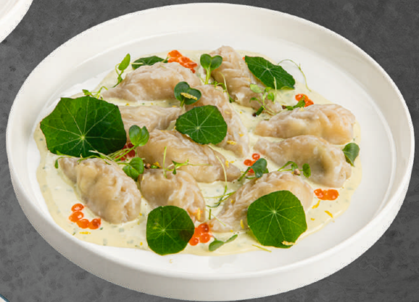
680- Pike perch dumplings with sauce 200 g