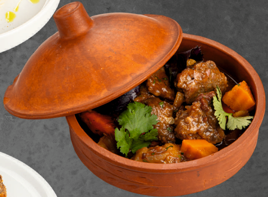
900- Beef rump steak with sauce 210 g