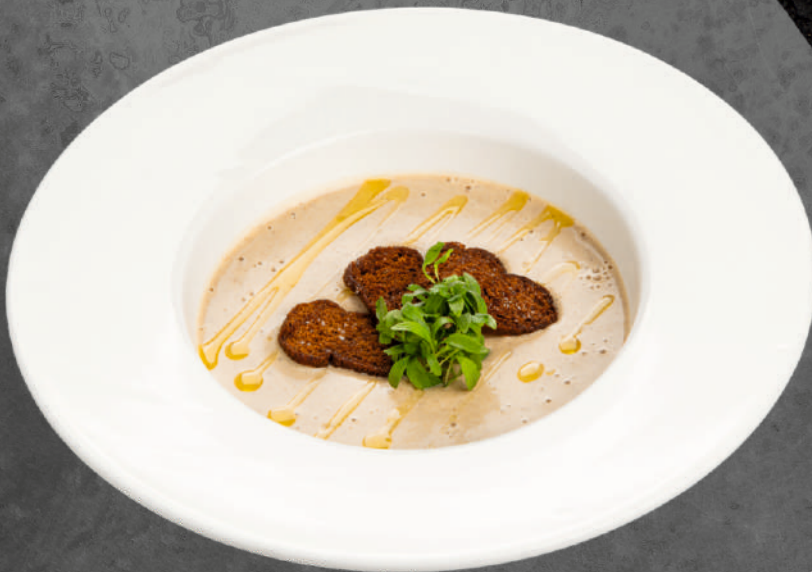
650- Cream of mushroom soup with truffle oil 250 g