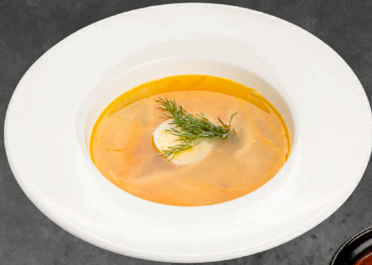
350- Chicken soup with vegetables, egg and noodles 250 g