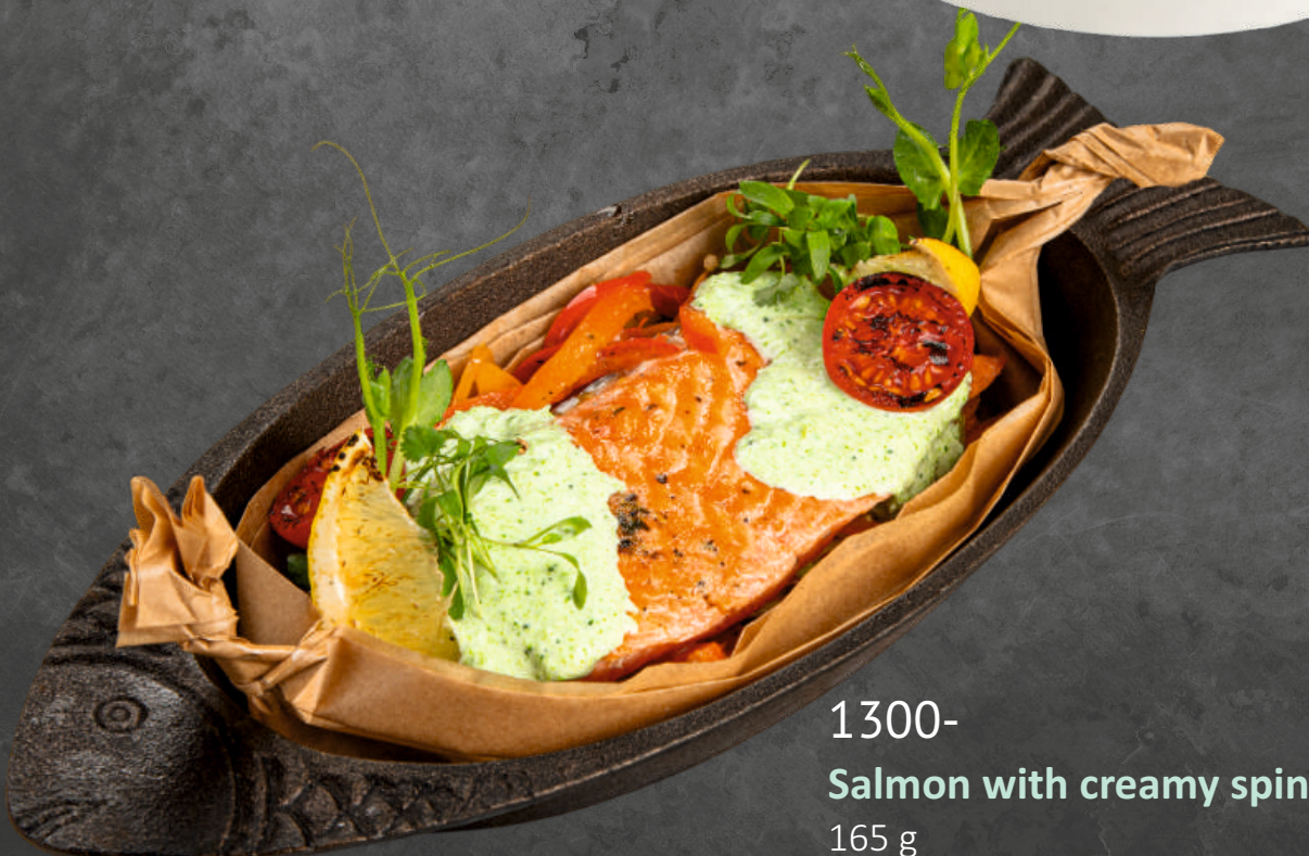
1300- Salmon with creamy spinach sauce 165 g