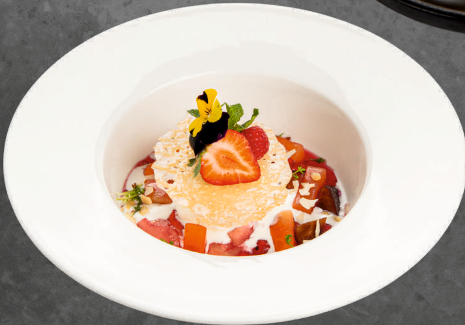
400- Maseduan (flambéed fruits with ice cream) 150 g