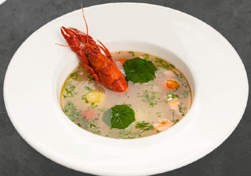
850- Fish soup «Ladozhskaya» with pike perch fillet, salmon and crayfish 250 g