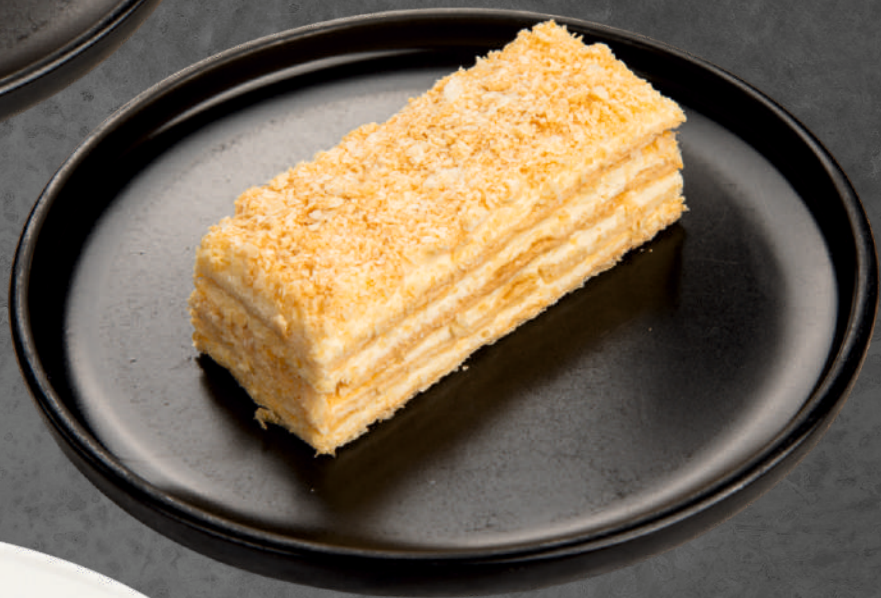
350- Napoleon 125 g