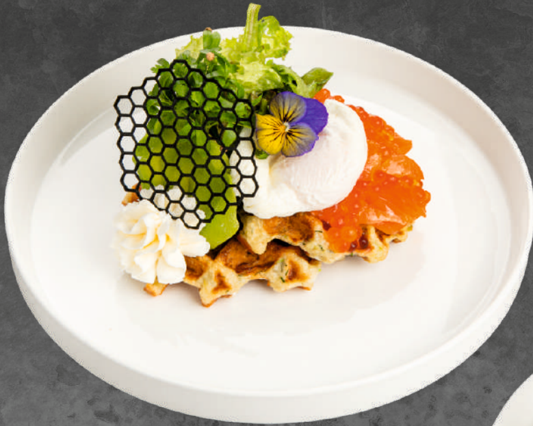
600- Zucchini waffles with lightly salted salmon and poached egg 180 g