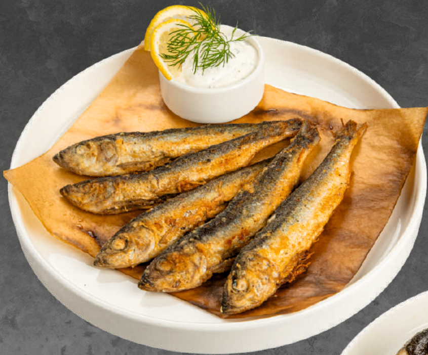
750- Fried vendace 270 g