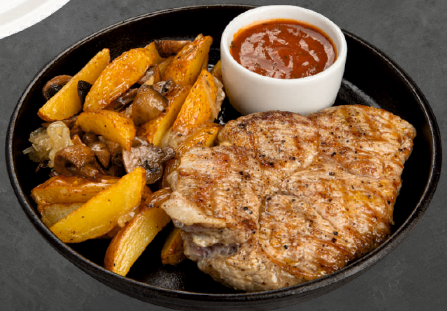
850- Pork neck with potatoes 400 g