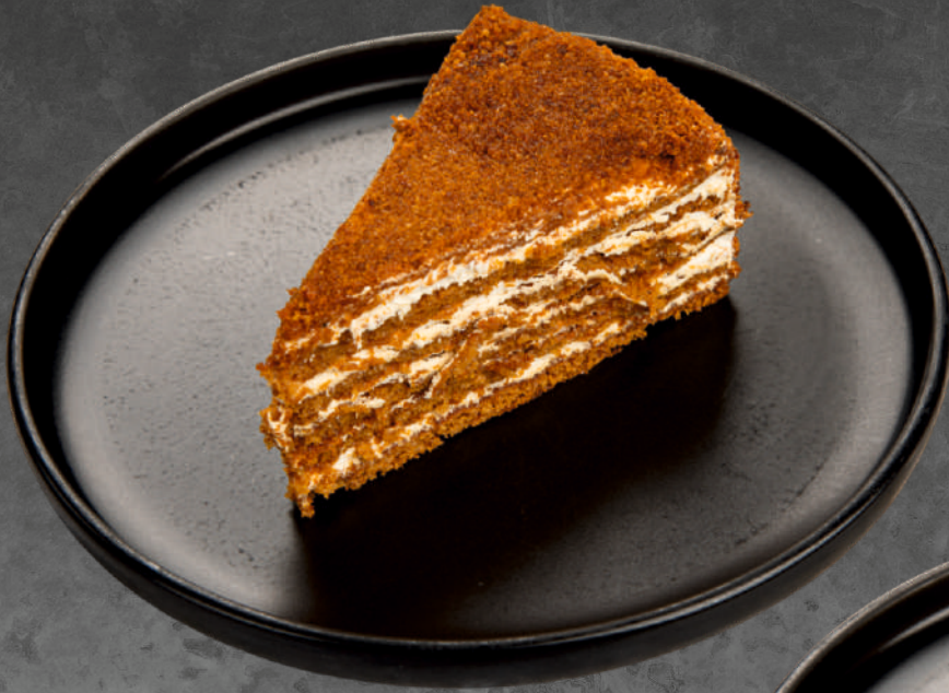
350- Honey cake 120 g