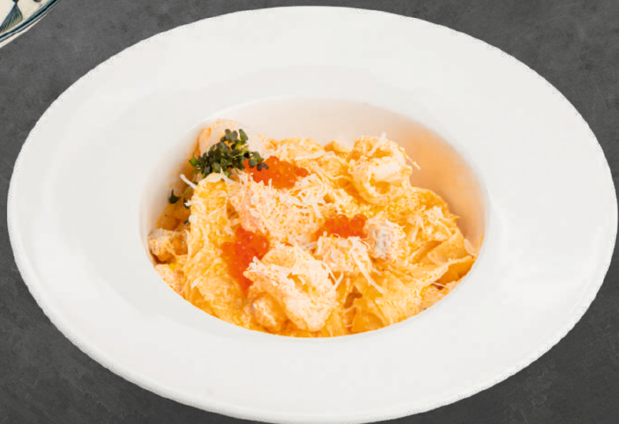
900- Noodles with trout and shrimp in a creamy tomato sauce 250 g