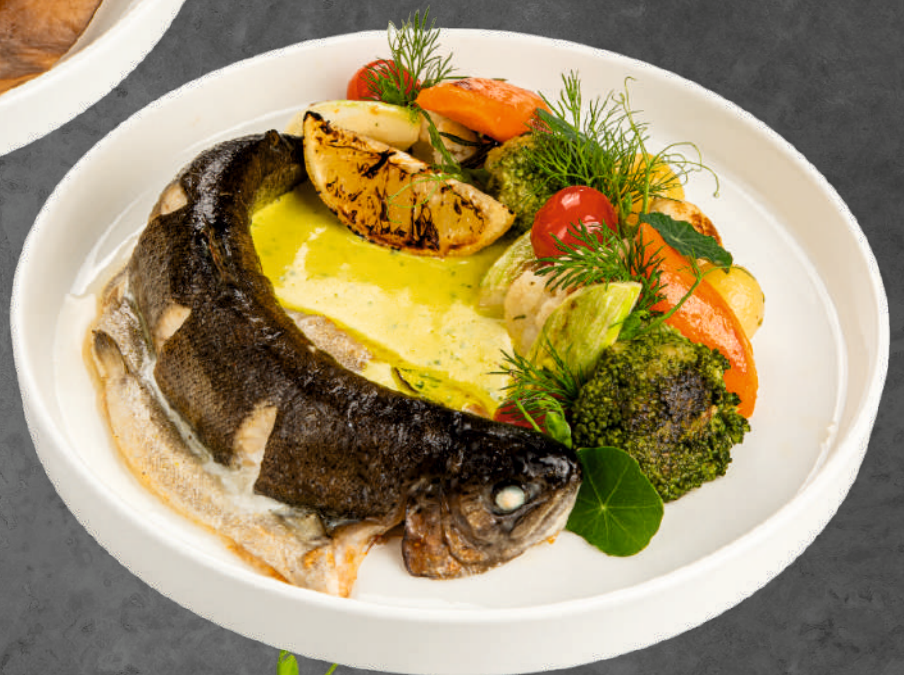
950- Trout with vegetable sauté 330 g