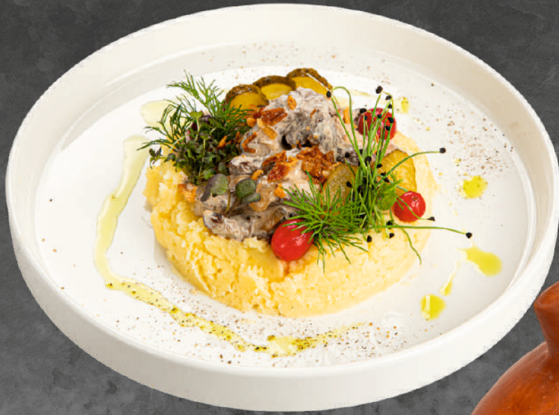
900- Beef Stroganoff with mashed potatoes 300 g