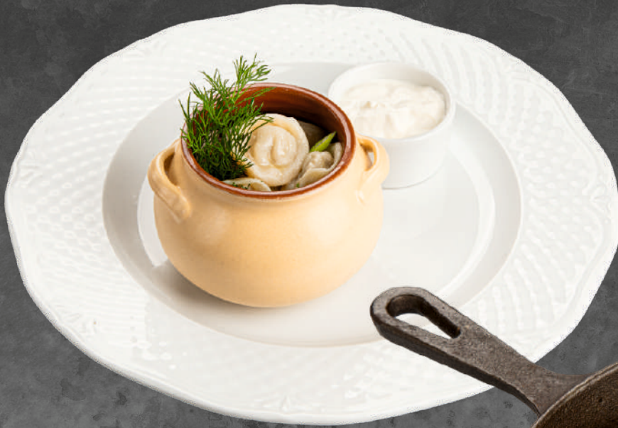
650- Homemade dumplings with sour cream 200 g